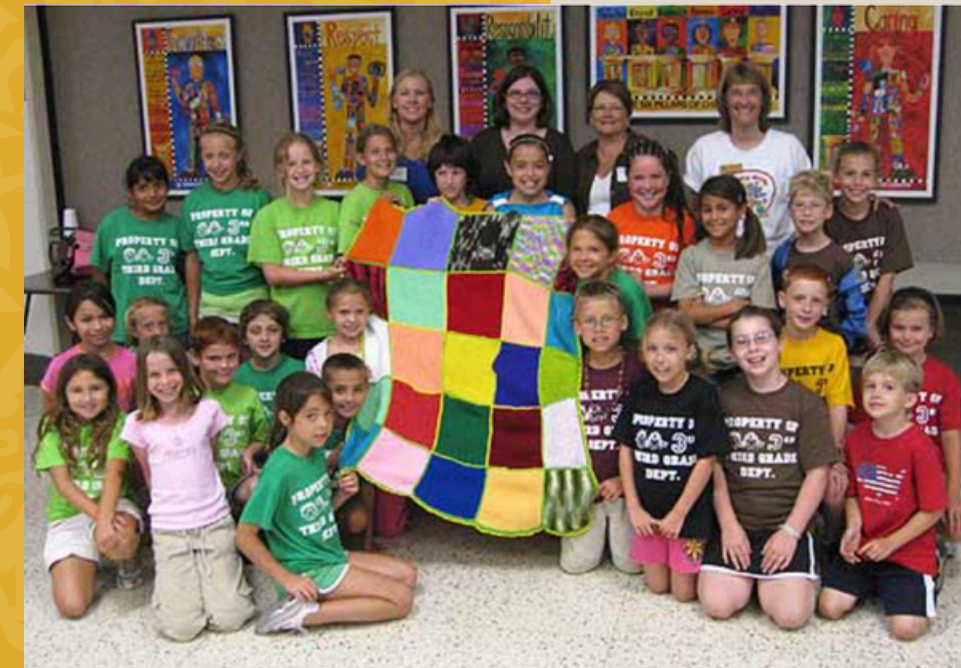
Grade 3 students, Westwood Elementary